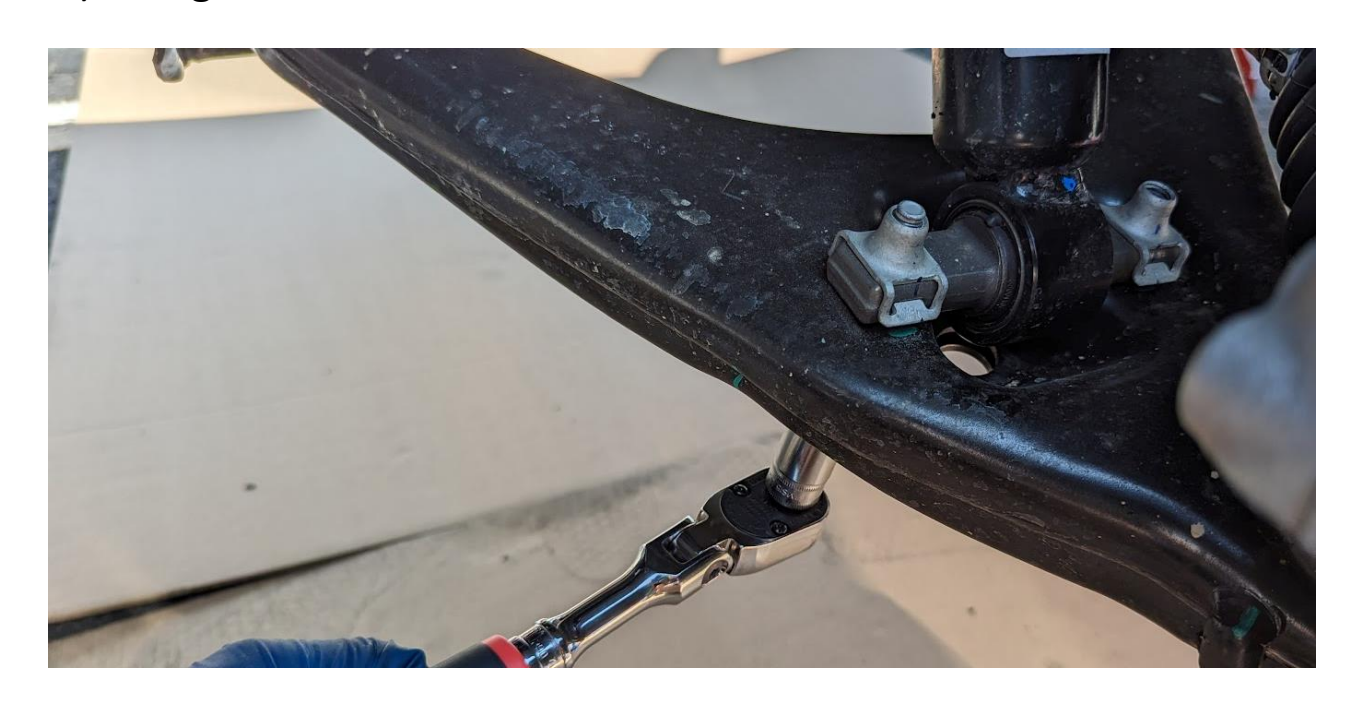
5) Undo all clips for the line shown