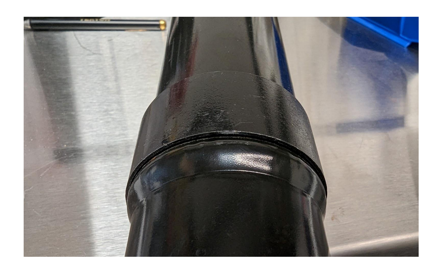
12) Place spring seat onto shock and shock spacer making sure it is fully seated