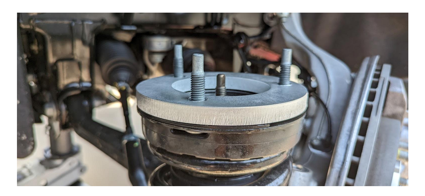
15) Reinstall the shock into the vehicle