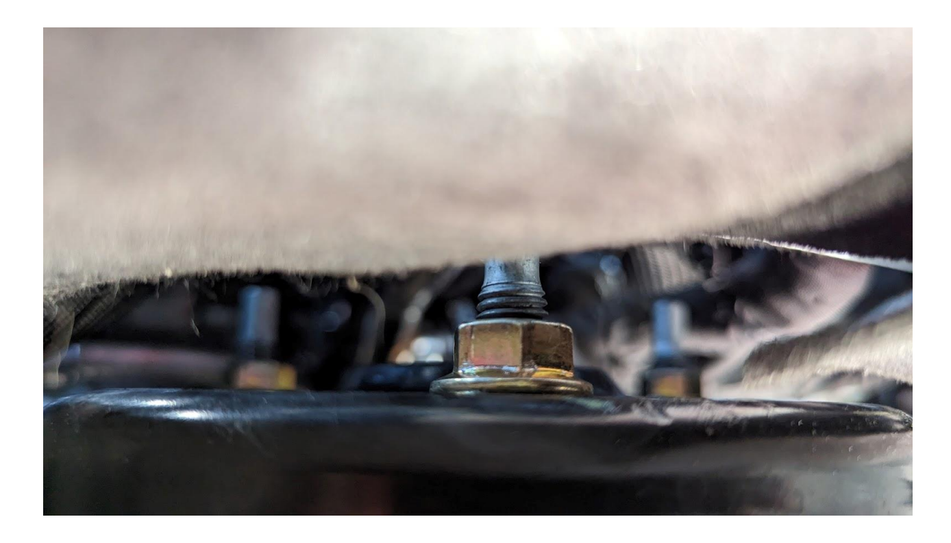
17) Reassemble suspension and repeat on both sides