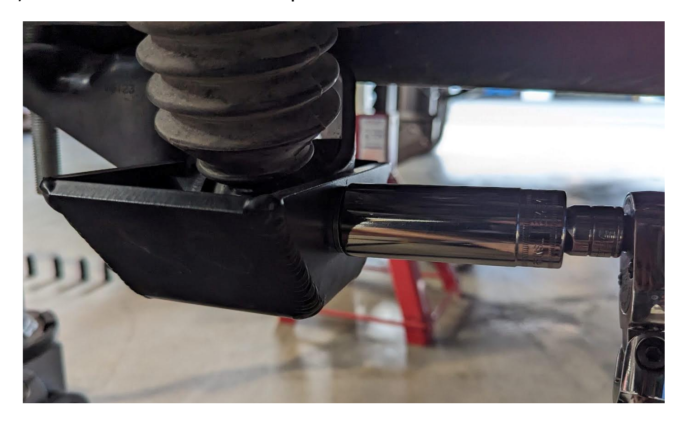
6) Using 22mm wrench mostly tighten nut onto back side of shock skid