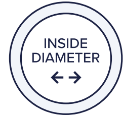
Circles represent US ring size and diameters.