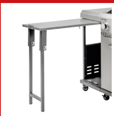
Stable side table that folds out