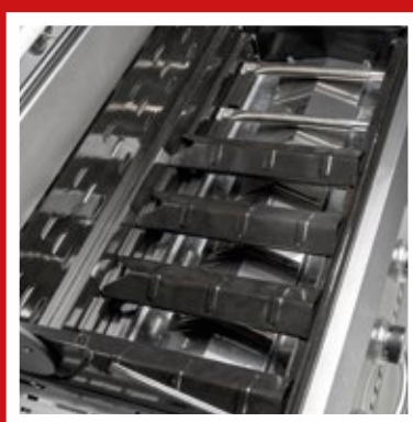
6 stainless steel burners