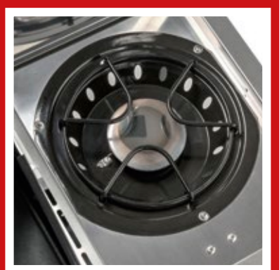
cook zone: for side dishes & sauces directly on the barbecue