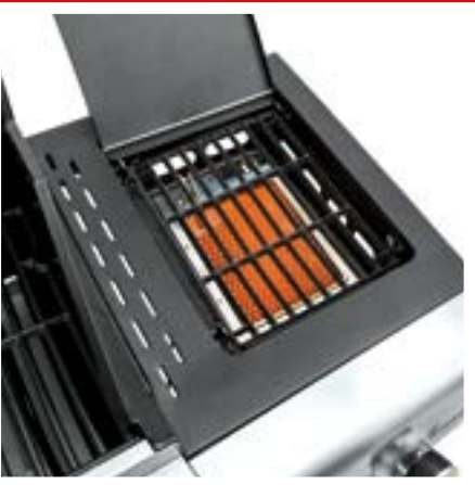
maxX zone: for searing at up to 800°C