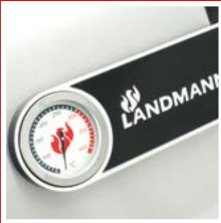
Temperature display in the lid