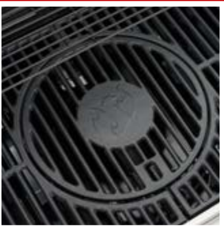
Enamelled cast-iron racks with Modulus system