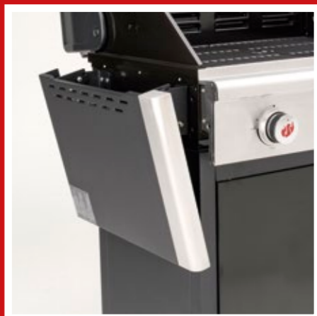
Folding side tables