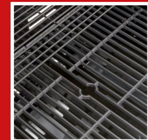
Enamelled cast-iron racks