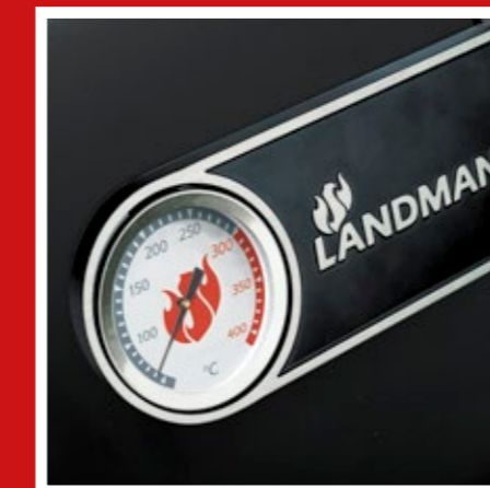
Temperature display in the lid