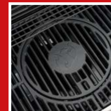
Enamelled cast-iron racks with Modulus system