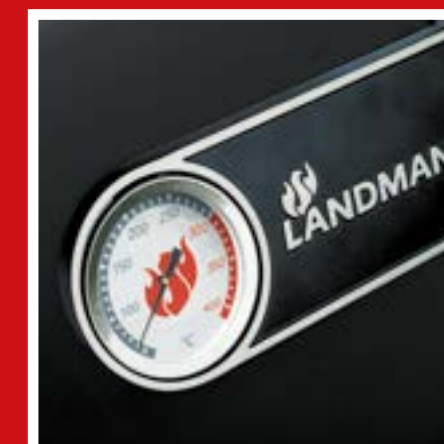
Temperature display in the lid