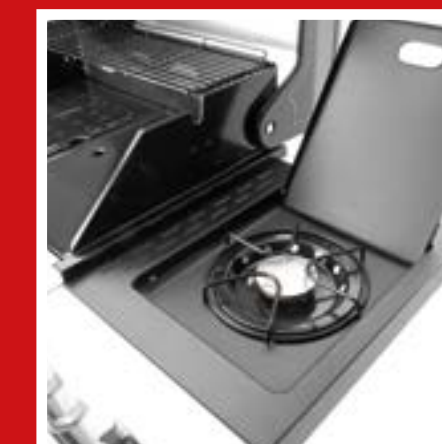
cook zone: for side dishes & sauces directly on the barbecue