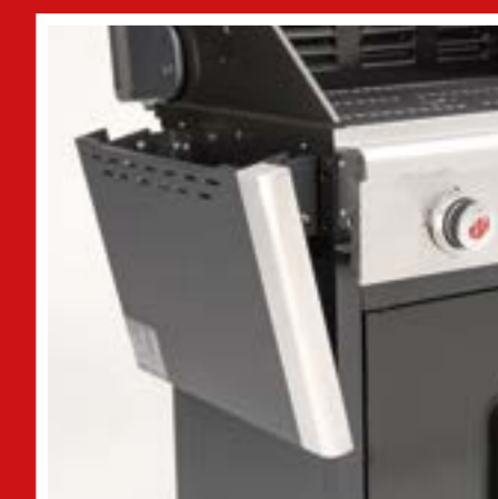
Folding side tables