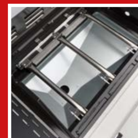
3 stainless steel burners