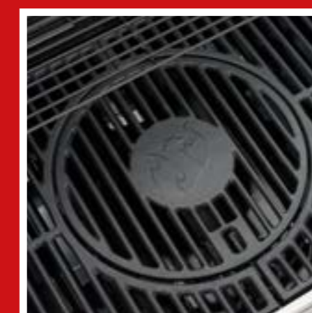
Enamelled cast-iron racks with Modulus system