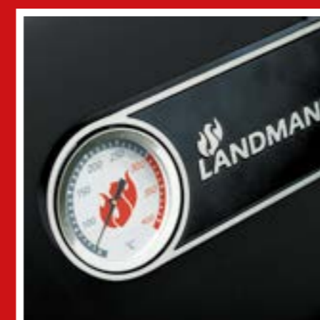
Temperature display in the lid