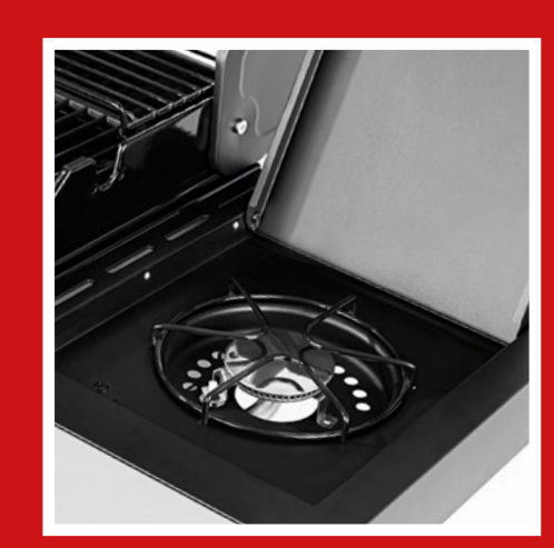
Cook zone: for side dishes & sauces directly on the barbecue