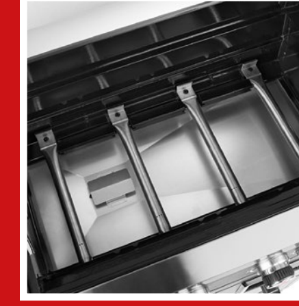
4 stainless steel burners