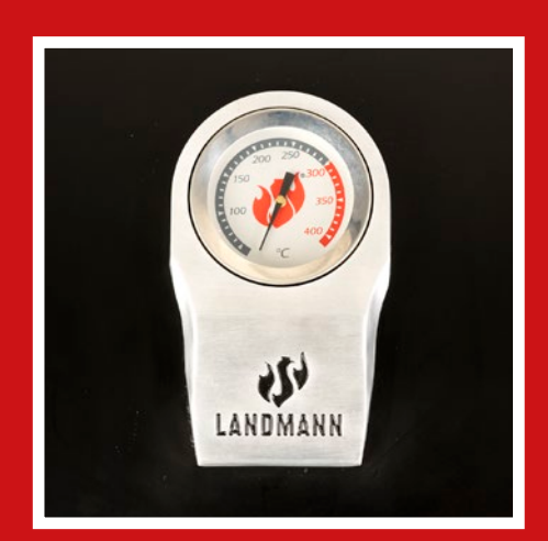
Temperature in lid