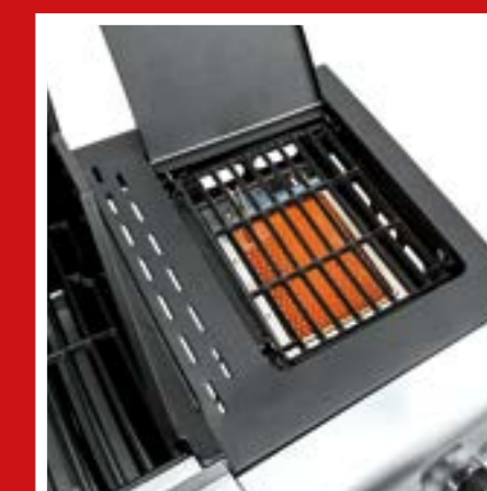
maxX zone: for searing at up to 800°C