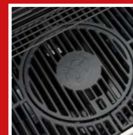
Enamelled cast-iron racks with Modulus system