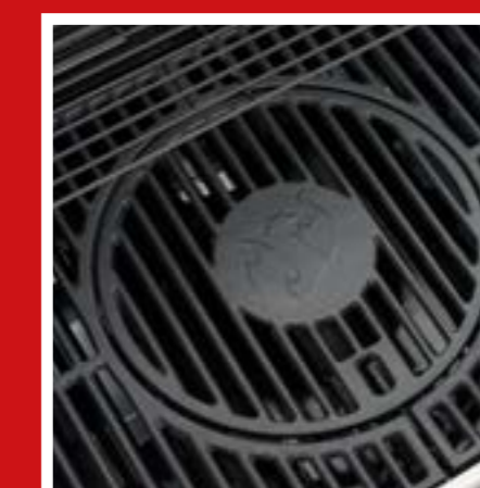
Enamelled cast-iron racks with Modulus system