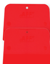
12x11x9 cm 2 szt.