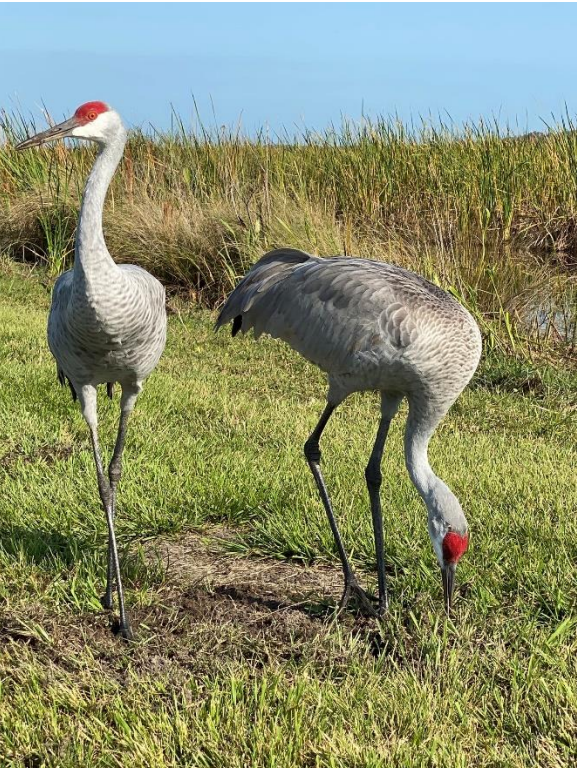
Lake Woodruff cranes