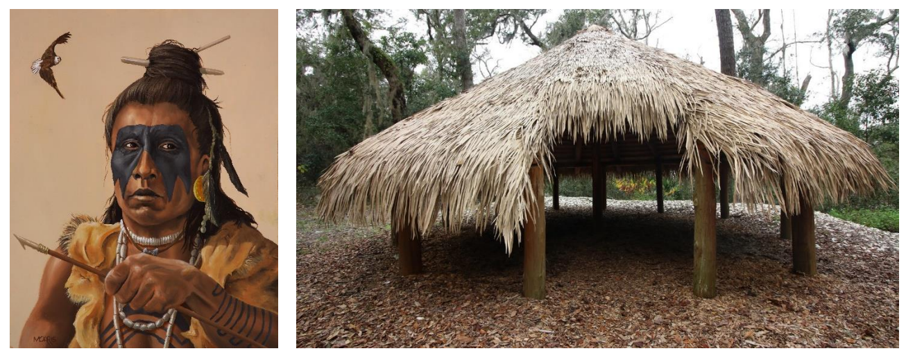
Timucua Fisherman Timucua palm frond hut

Did you know that the Thursby House is built on a huge mound of shells (a midden) discarded by generations of Timucua people? Year after year, they harvested and ate snails and tossed the shells and other debris into the midden, and even though it might be tempting to pick up a snail shell around the Thursby House, please don't! That is a piece of our local history that we want to preserve.