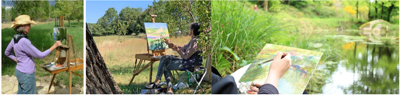
https://www.outdoorpainter.com; https://blog.artweb.com; https://www.artfinder.com/blog/post/plein-air/#/

While the event is free for guests, the regular park entrance fees must still be paid at the entrance. We look forward to seeing you soon for a day of art, nature, community, and culinary delights!