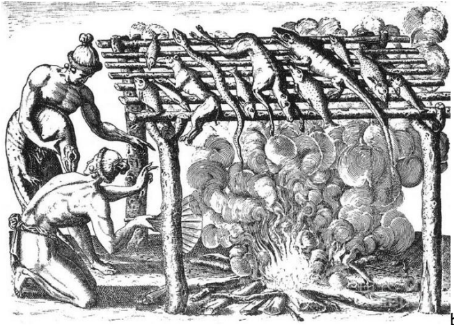
by Teodor de Bry (Florida State Archives)

We have all seen "Indians" on TV, but those portrayals are often very different from reality. The primary tribe that was occupying the St. Johns River around Blue Spring before Europeans arrived, was the Timucua. The Timucua were agricultural (planting squash, maize, cucumbers, peas, and beans), foraged for wild berries & roots (e.g. sassafras), and hunted game (bear, deer, boar, opossum, manatees, and alligators). Fish and shellfish (especially snails) were also a large part of their diets. I bet you didn't know that the word barbeque is thought to originate in the Timucua language! The Timucua were roasting game over a framework of sticks over a fire, and that clearly made an impression on the Spanish explorers.