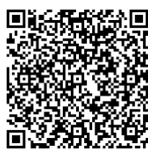
Agrozen Laboratory Authenticity QR Code