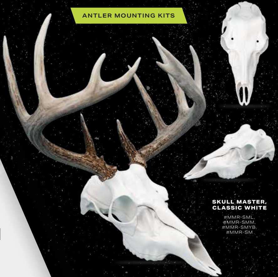
SKULL MASTER, CLASSIC WHITE