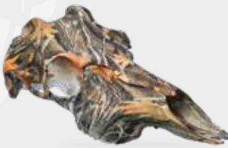
FALL FOLIAGE CAMO

#MMR-SMLSC, #MMR-SMMSC, #MMR-SMYBSC, #MMR-SMSC