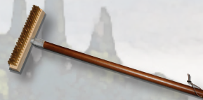
10330 10" heavy duty oven brush, with brass bristles and scraper