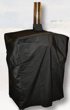
10603 medium oven cover for GX-B1