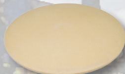
10413 13" pizza stone