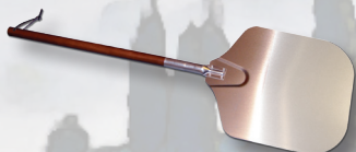
10035 35" pizza peel 12" x 14" aluminum blade

Look for these Tuscan Chef Accessories to protect and enhance your cooking experience!