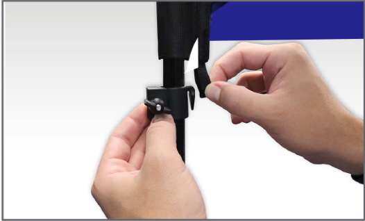
Step 4: Attach the fabric loop to the hook on the locking mechanism.