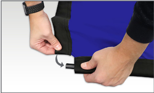
Step 3: When you have reached the corner gap, continue weaving the fabric through the pole. Keep pushing the pole and pulling the fabric down until you reach the locking mechanism.