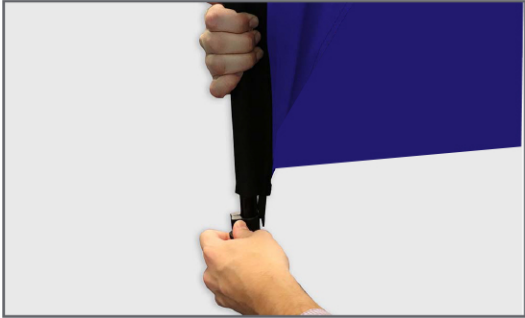
Step 5: Pull down the flag to the right tension.