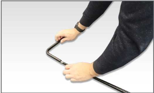
Step 1: Unpack the carry bag and assemble the flag pole by joining the separate pieces together. Simply insert one end of the pole into the other and push them together starting with the largest to the smallest. The horizontal pole (with the right angle bend) should be at the top.