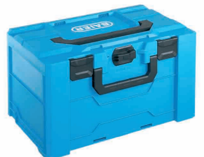
Transport case (MetaBOX 280 L)