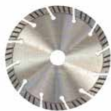
Diamond cutting blade