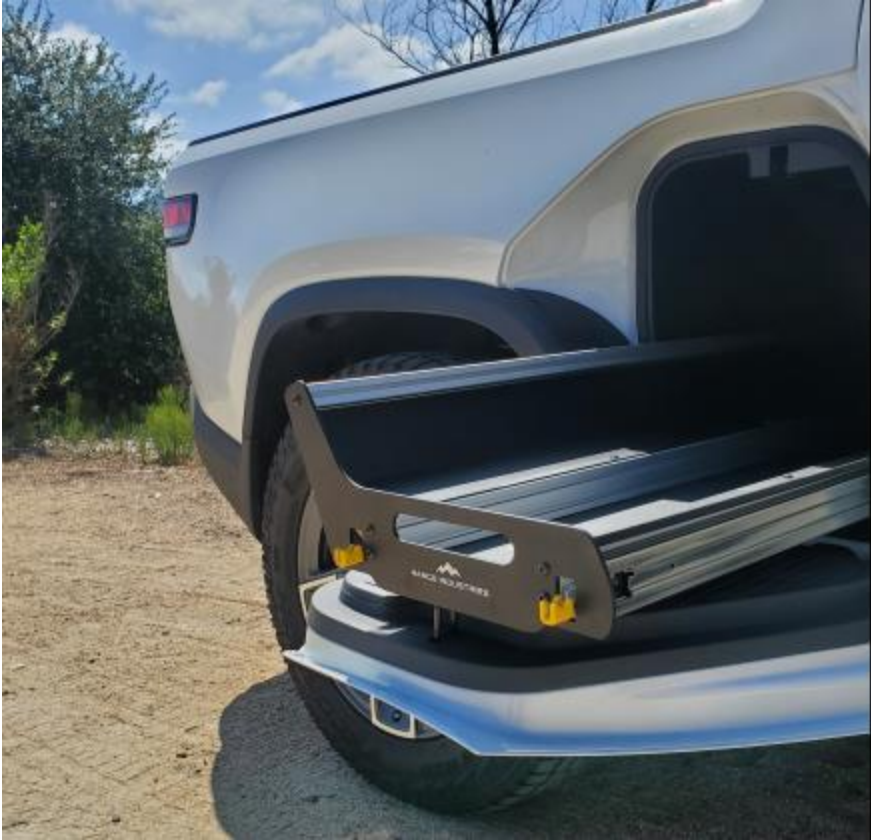
Passenger Side Orientation Installed