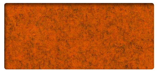
Sunset Orange (SO)