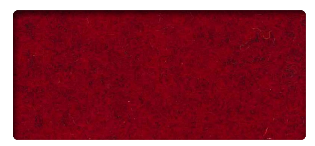
Chilli Red (CR)