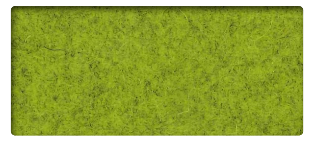
Avocado Green (AV)