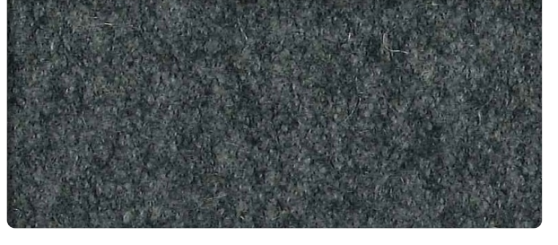
Stone Grey (ST)