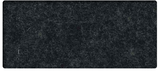
Charcoal Grey (CL)