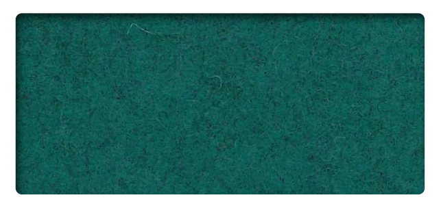
Emerald Green (EM)