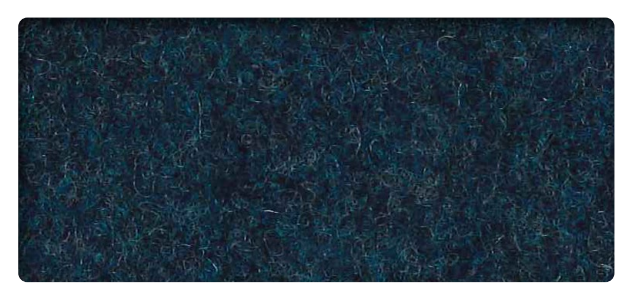
Deep Blue (DB)