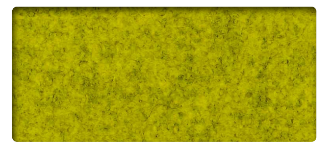
Bumblebee Yellow (BB)