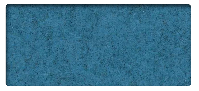
Ice Blue (IC)