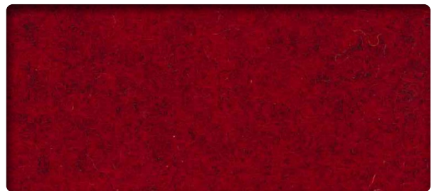
Chilli Red (CR)