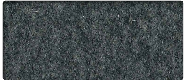
Stone Grey (ST)