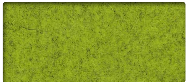
Avocado Green (AV)