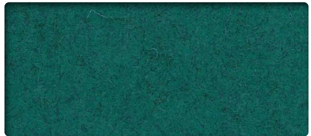
Emerald Green (EM)