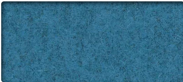
Ice Blue (IC)