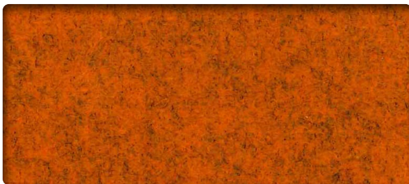
Sunset Orange (SO)