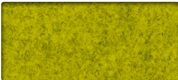
Bumblebee Yellow (BB)