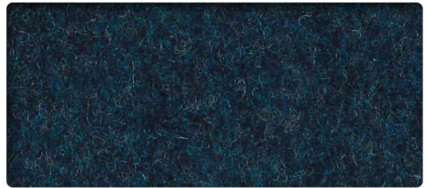
Deep Blue (DB)