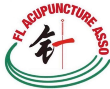
Florida Acupuncture Association