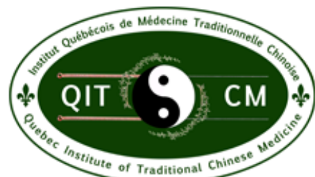
Québec Institute of Traditional Chinese Medicine