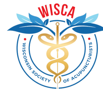
Wisconsin Society of Acupuncturists