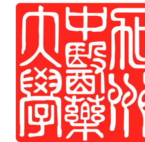
Five Branches University