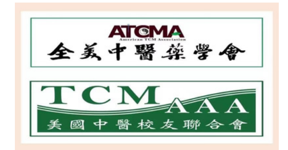
American TCM Association TCM American Alumni Association