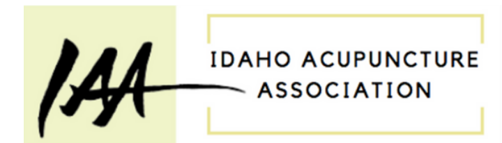
IDAHO ACUPUNCTURE ASSOCIATION