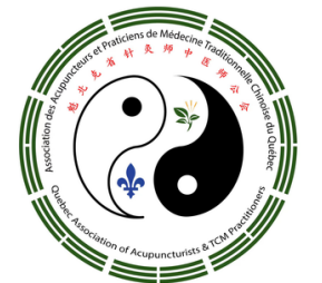
Quebec Association of Acupuncturists and TCM Practitioners