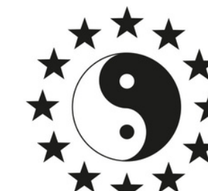
European Institute for Traditional Chinese & Ayurvedic Medicine