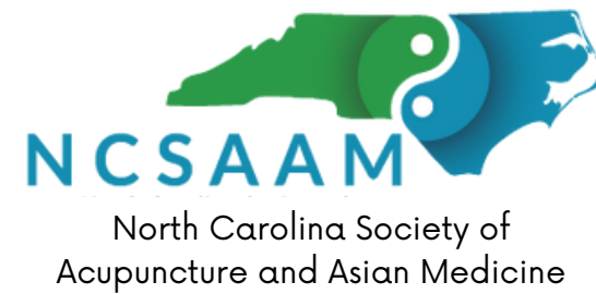
North Carolina Society of Acupuncture and Asian Medicine