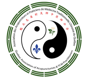
Quebec Association of Acupuncturists and TCM Practitioners