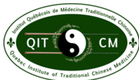
Québec Institute of Traditional Chinese Medicine