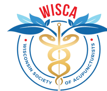
Wisconsin Society of Acupuncturists