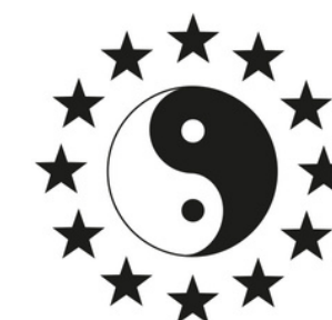
European Institute for Traditional Chinese & Ayurvedic Medicine