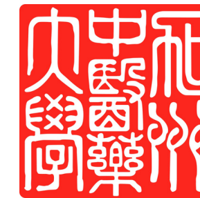
Five Branches University