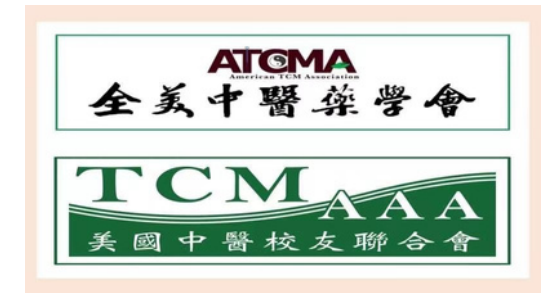
American TCM Association TCM American Alumni Association