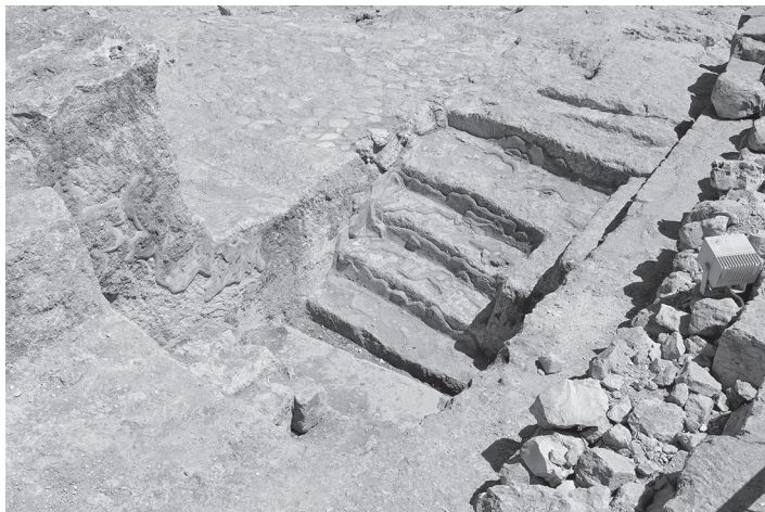
Photo of a mikveh next to the Temple in Jerusalem. Men would enter down the left side, immerse themselves, and come up the right side. The purpose was not physical cleansing but spiritual. Notice the wear on the steps on each side. Archaeologists have discovered 1st century mikvehs are all over Israel.