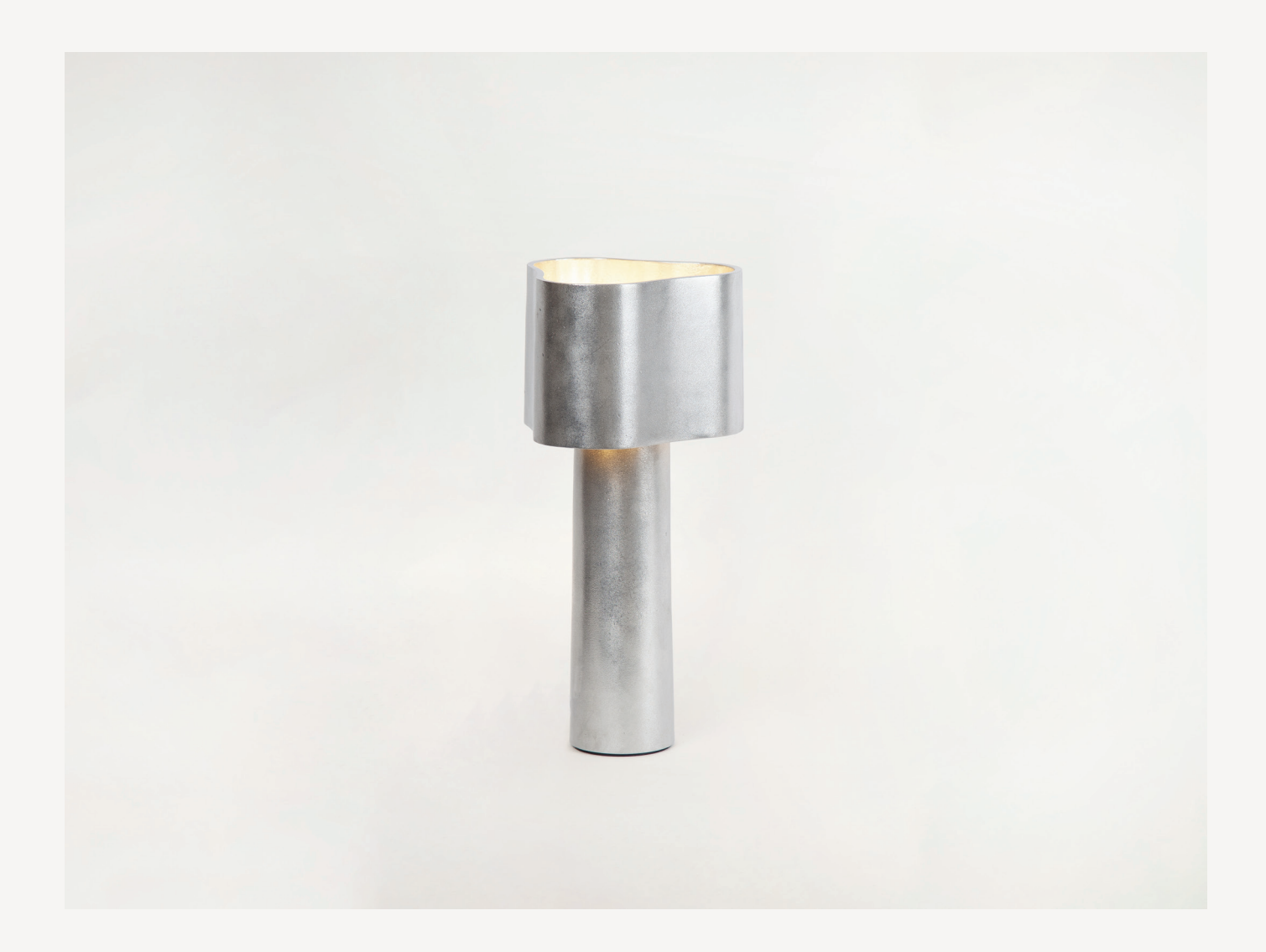
COY TABLE LAMP Specification Sheet