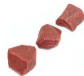
Cubes for Kabobs (Braise, Broil, Grill)