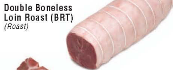
Double Boneless Loin Roast (BRT) (Roast)