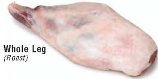
Whole Leg (Roast)