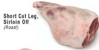
Short Cut Leg, Sirloin Off (Roast)