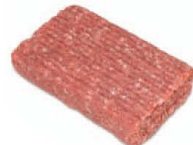
Ground Lamb (Broil, Grill, Panbroil)