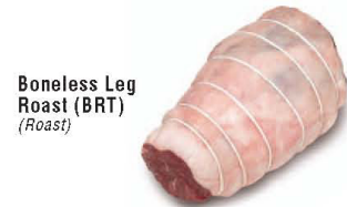
Boneless Leg Roast (BRT) (Roast)