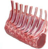
Frenched Rib Roast (Broil, Grill, Roast)