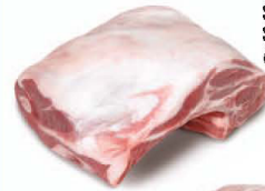
Square Cut Shoulder Whole (Braise, Roast)