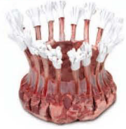
Crown Roast (Roast)