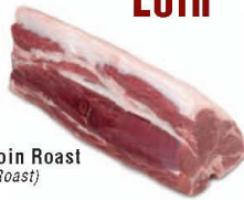
Loin Roast (Roast)