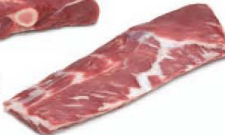
Spareribs (Denver Ribs) (Braise, Broil, Grill, Roast)