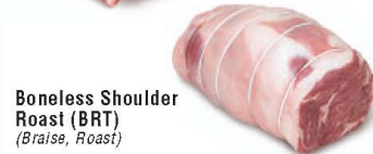
Boneless Shoulder Roast (BRT) (Braise, Roast)