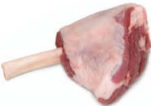
Frenched Hindshank (Braise)