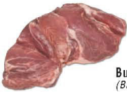
Butterflied Leg (Broil, Grill, Roast)