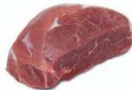
Top Round (Broil, Grill, Roast)