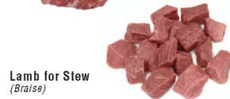
Lamb for Stew (Braise)