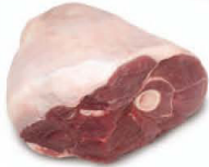
Center Leg Roast (Roast)