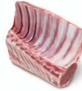
Rib Roast (Broil, Grill, Roast)