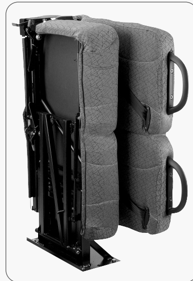
Stowed Position Foldaway Seat