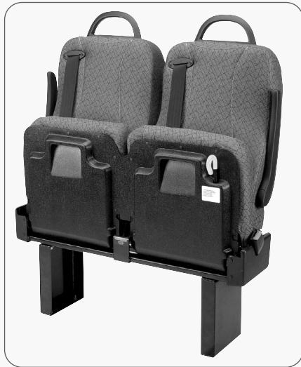
Stowed Position Flip Seat