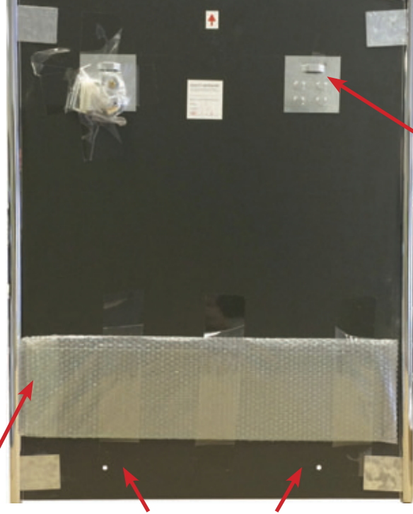
Pre-drilled holes for inserting shelf mounting brackets.

Glass Shelf is packaged and taped to the back of the mirror.