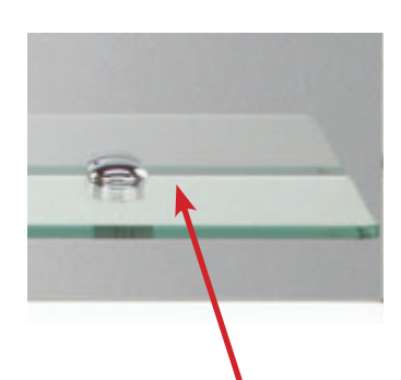
Shelf Chrome mounting brackets for shelf insertion.

Mounting Brackets pre-installed on back of mirror.