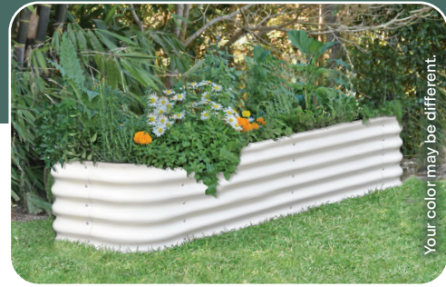
Your color may be different.