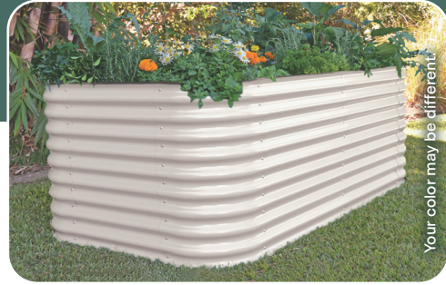
Your color may be different.