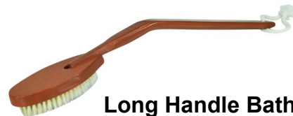
Long Handle Bath Brush VM971B