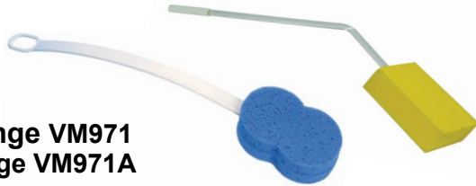
Bath Sponge VM971 Bath Sponge VM971A