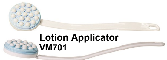
Lotion Applicator VM701