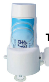
Tube Squeezer VM917