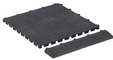
MultiPro Grit - Closed