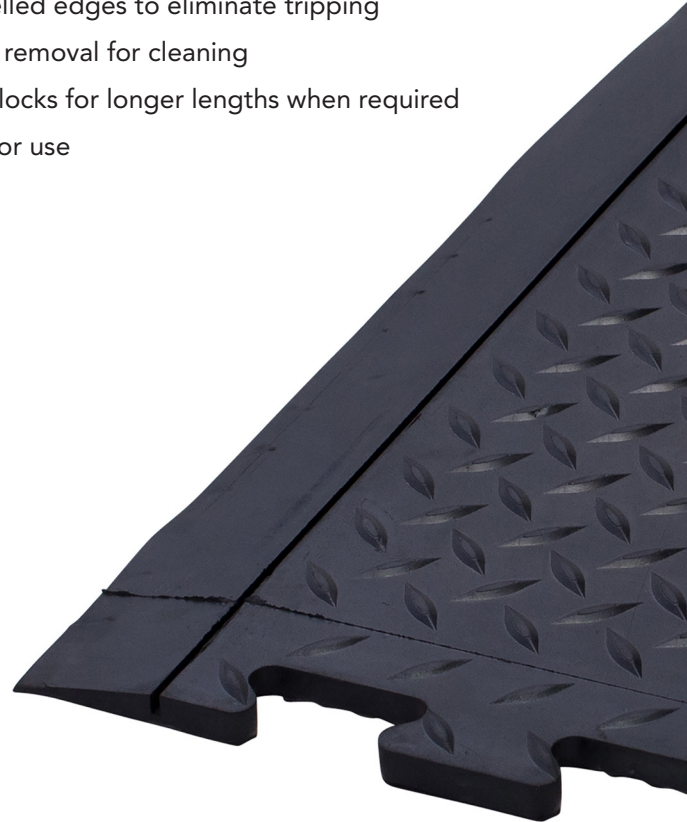
Link Mat Centre