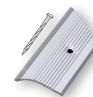
AKO Edge Bar & Nails