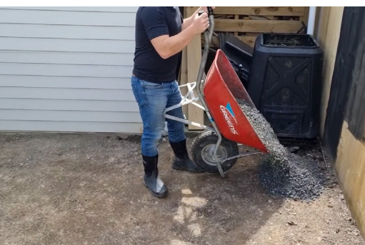
a. Pour out the top course

2. Lay 50-70mm of your top course. You want the top course height to be 10-15mm lower than the level you're trying to achieve: