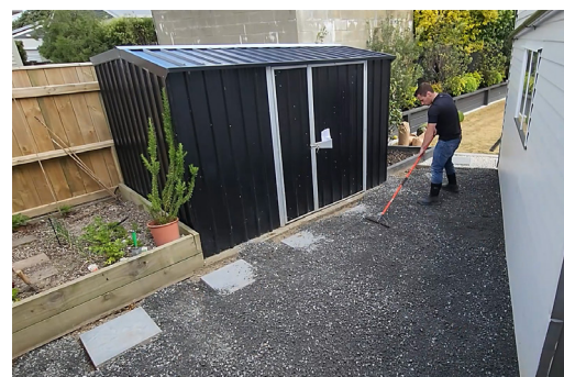
b. Level it with a rake and straight edge