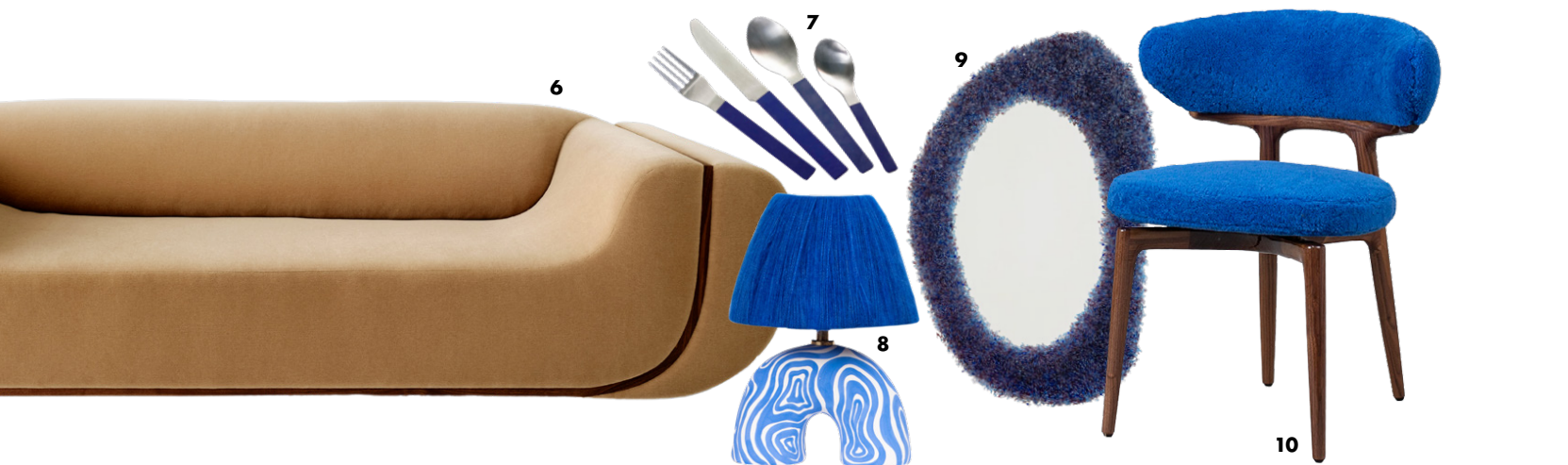
6 'Linea' sofa by Estudio Persona, £15,502, Objects With Narratives ( objectswithnarratives.com ) 7 'MVS' cutlery set by Muller Van Severen, £49 for a set of four, Hay ( hay.dk ) 8 'Me' table lamp in 'Cobalt Wave', £310, Hannah Simpson Studio ( hannahsimpsonstudio.com ) 9 'Crumble de Verre' mirror by Riccardo Cenedella, £5,400, Monologue ( monologuelondon.com ) 10 'Clotilde' leather chair by Roberto Lazzeroni, from approx £3,473, Baxter ( baxter.it ) ED