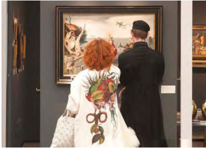
Above: a view of Frieze Masters .

Coinciding with the National Portrait Gallery's Portrait Mode project and London Art Week , Agnew's is holding an exhibition dedicated to German artist Erich Wolfsfeld (1884-1956).