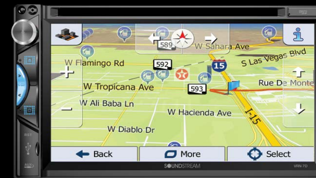
GPS NAVIGATION + PHONELINK FOR ANDROID