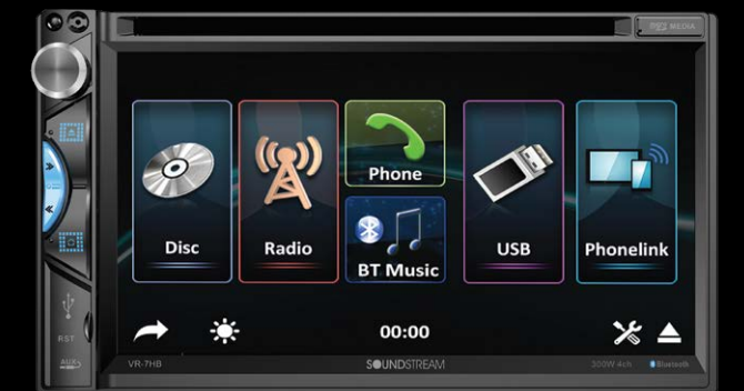
DVD AUDIO/VIDEO + PHONELINK FOR ANDROID