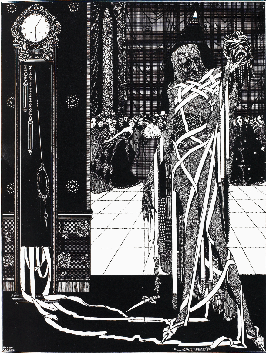
THE DAGGER DROPPED GLEAMING UPON THE SABLE CARPET

their evolutions; and there was a brief disconcert of the whole gay company; and, while the chimes of the clock yet rang, it was observed that the giddiest grew pale, and the more aged and sedate passed their hands over their brows as if in confused reverie or meditation. But when the echoes had fully ceased, a light laughter at once pervaded the assembly; the musicians looked at each other and smiled as if at their own nervousness and folly, and made whispering vows, each to the other, that the next chiming of the clock should produce in them no similar emotion; and then, after the lapse of sixty minutes, (which embrace three thousand and six hundred seconds of the Time that flies,) there came yet another chiming of the clock, and then were the same disconcert and tremulousness and meditation as before.