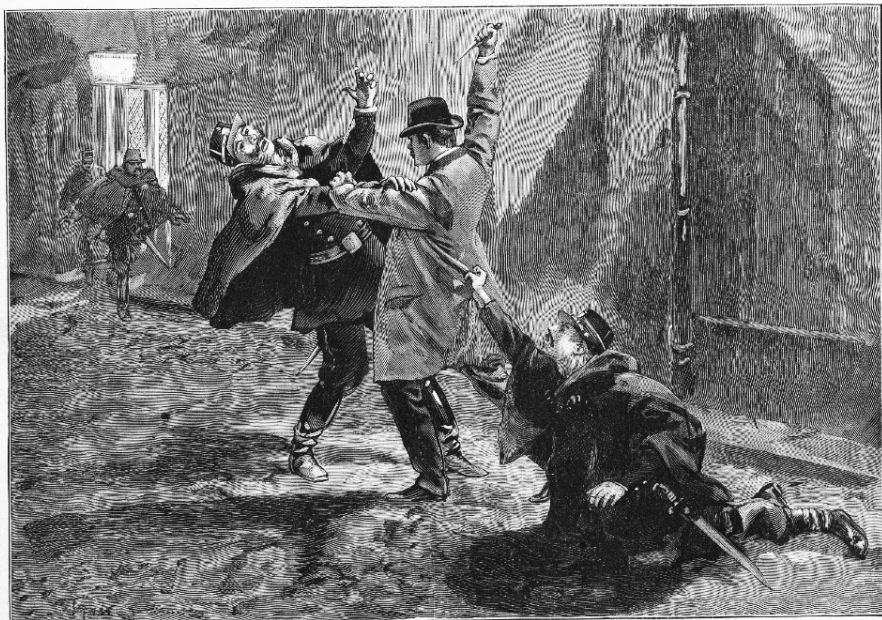
A coups de couteau!