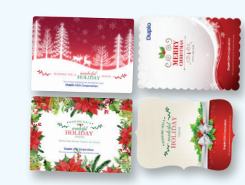
die cut pieces