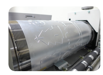
MAGNETIC CYLINDER AND FLEXIBLE DIE

The UD-M300 features a hand feed system and fine tune adjustments for precise and accurate diecut applications.