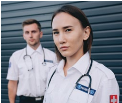
Faster Medical Assistance