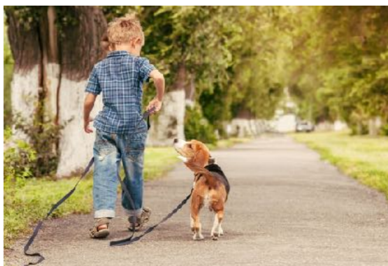
G37 G38 (all scores)