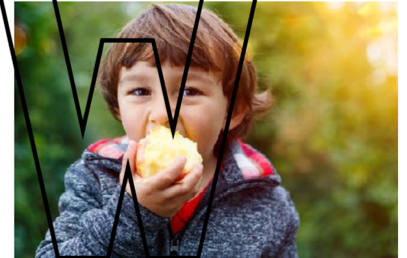
G37 G38 (all scores)