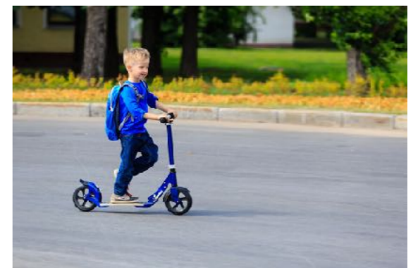
G37 G38 (all scores)