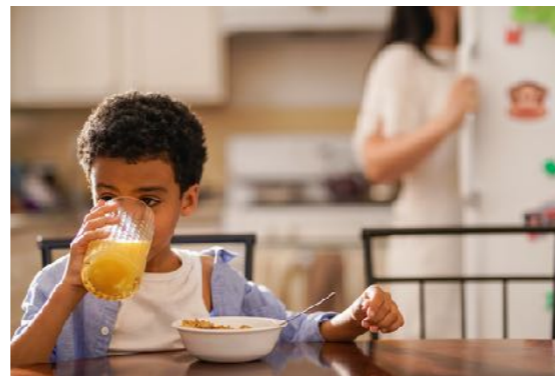
G37 G38 (all scores)