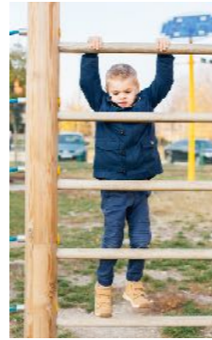
G37 G38 (all scores)