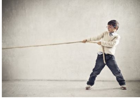
G37 G38 (all scores)