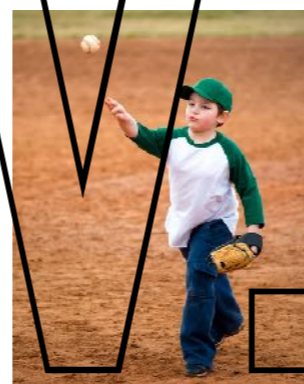
G37 G38 (all scores)