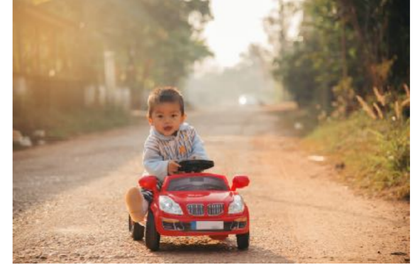
G37 G38 (all scores)