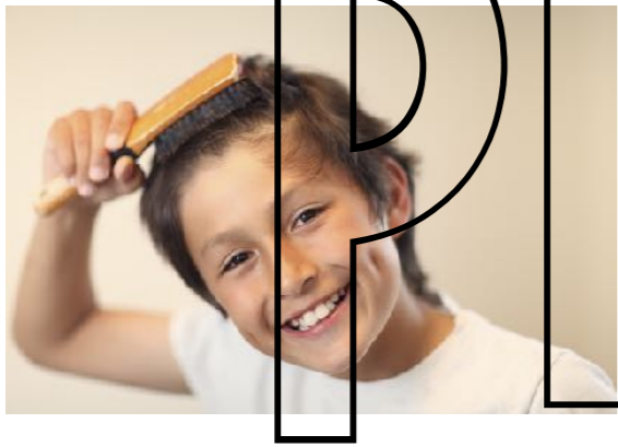
G37 G38 (all scores)