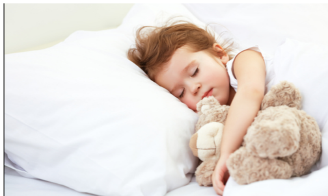
G8 (all scores)