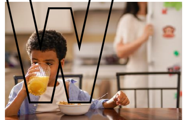
G8 (all scores)