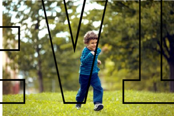
G8 (all scores)