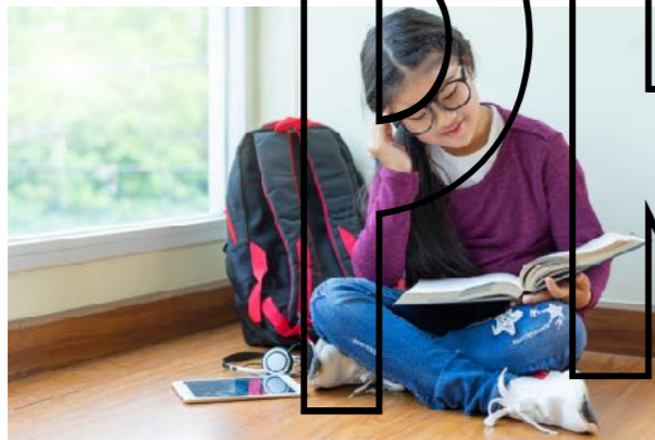
G8 (all scores)