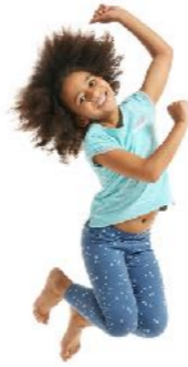
G8 (all scores)