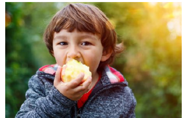
G8 (all scores)