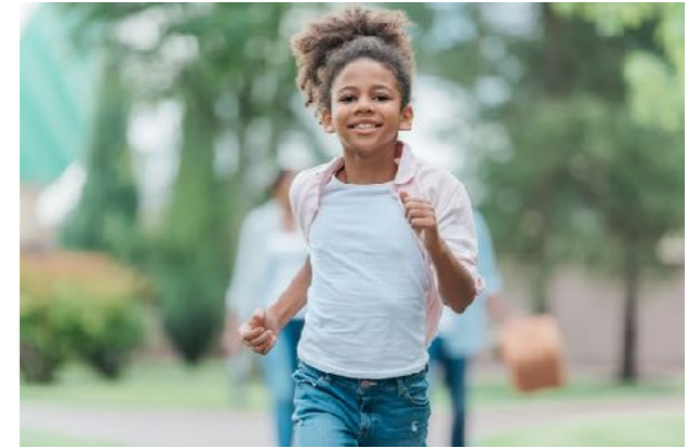
G8 (all scores)