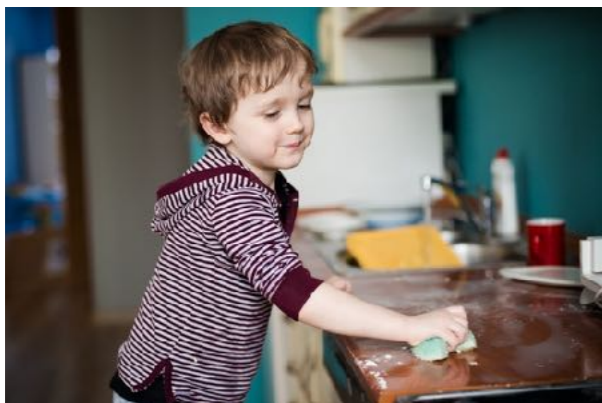
G8 (all scores)