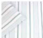
Kitchen wallpaper: Laura Ashley in Silkram Stripe Palm Sea spray