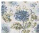
Wallpaper: Laura Ashley in Elysium Sea spray II and Silkram Stripe Palm Sea spray (see The Daisy)