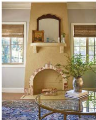
New wood trim and bannards from Woodgrain frame both the room and the windows, and help bridge the old architecture with the new furnishings, such as the Roman shades from 3 Day Blinds. Sara loves to mix and match textures, so she selected a glass coffee table for the living room. "Since the space is small, the round glass coffee table makes it feel lighter and airier," she says.