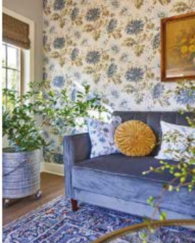
A decadent velvet sofa adds a glamorous touch to the Laura villa. "The style is vintage and romantic, but it's also very practical," Sara says. "You'd never know from its aesthetic, but it actually folds out like a futon. It was important to me to make sure the villa sofas do this so each one has room for little to sleep, if desired."