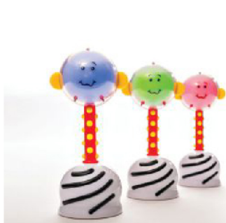
NogginStik from Ableplay