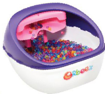
Orbeez from Ableplay