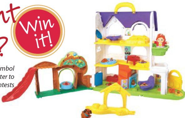
Smart Friends Busy Sounds Discovery Home from Ableplay

Look for this symbol on pages then enter to WIN at PSN Contests