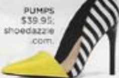
PUMPS $39.95; shoedazzie.com