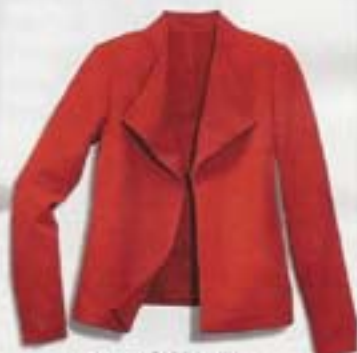
JACKET $169; talbots.com. Up to size 20.

EARRINGS $195; byboe.com (20% off with code REDBOOK20) DRESS $180; isurastyleusa.com (10% off with code REDBOOK10) HEELS $99; aerosoles.com