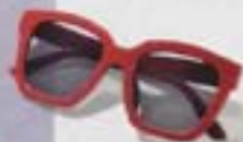
SUNGLASSES $45; perverse sunglasses.com