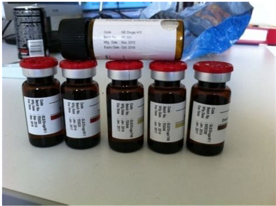
Humatrope cartridge for pen Somatropina, Somatropin : 36 I.U. 12mg Human Growth Hormone 36IU pen use with syringe or pen. Manufacturer: Eli Lilly Substance: Human Growth Hormone call us for

Buy Humatrope HGH Pen & Somatropin HGH Pen & Somatropin pen 5mg 16iu, 12mg 36iu - HGH Online Humatrope HGH Pen device. Humatropen 6mg, 12mg (36iu) and 24mg pre-filled HGH loaded pen. Humatrope HGH Pen 0.2mg, 0.4mg, 0.6mg, 0.8mg, 1.0mg, 1.2mg, 1.4mg, 1.6mg where the dose depends on your size, age and the endocrine condition for which you are. Buy Humatrope HGH Buy Humatrope 36iu Online - Humatrope - Humatrope Pen - Humatrope For Sale - Buy Humatrope Pen - Buy Humatrope Canada. Humatrope is a man-made form of human growth hormone. It was first approved in 1987 to treat children who are growing slowly because they do not make enough growth hormone on their own.